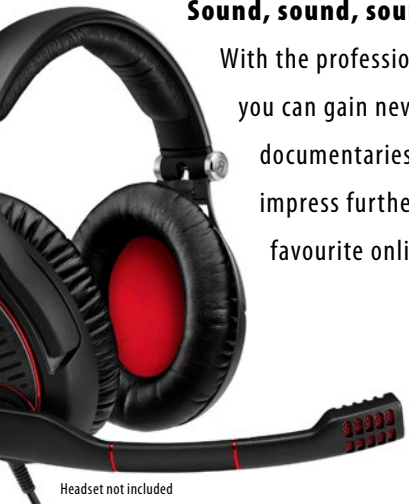
Headset not included

With the professional sound of a MiNiSTUDIO you can gain new audiences for your reports, documentaries and podcasts or you can impress further your opponents in your favourite online game.