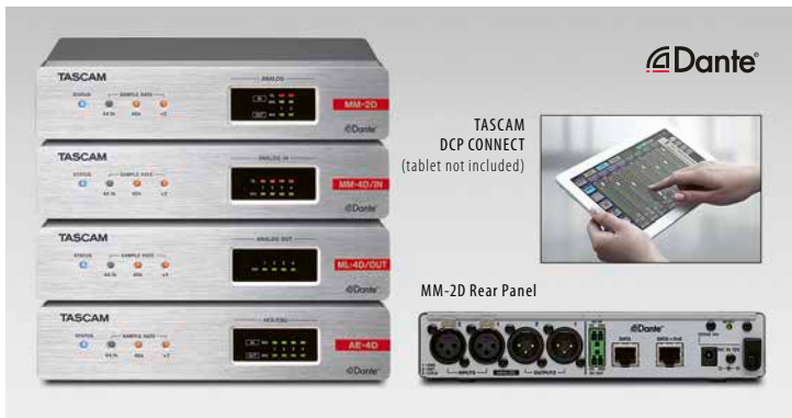
TASCAM DCP CONNECT (tablet not included)