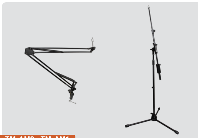
TM-AM2 · TM-AM1