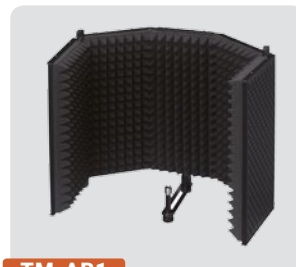
TM-AR1 Acoustic Control Filter