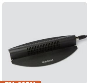
TM-90BM Boundary Microphone