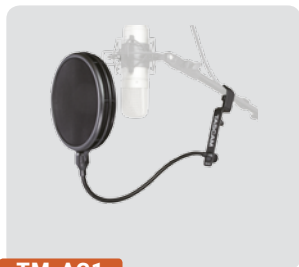
TM-AG1 Pop Filter